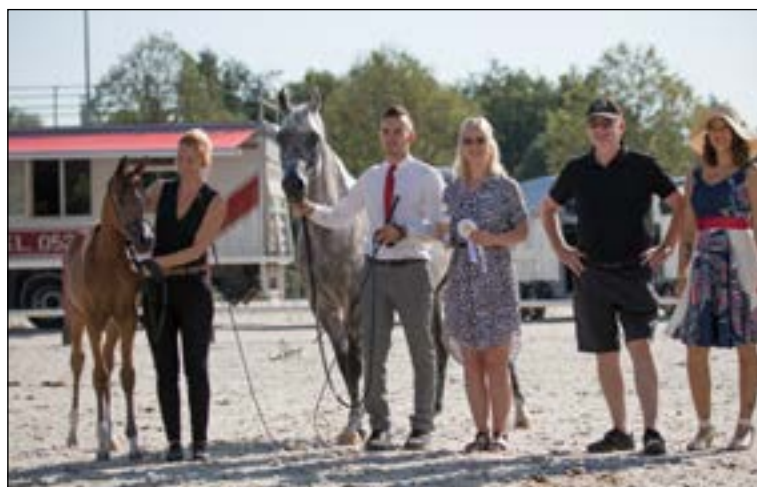
BRONZE MEDAL CHAMPION B.A. AMADORA MAGIC MON CHERI X ALTE DROGA K.A B&O: BEMBOM ARABIANS