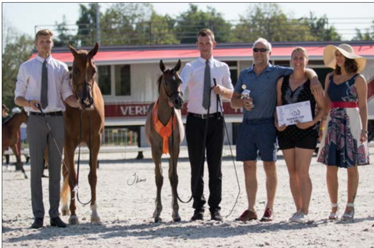
GOLD MEDAL CHAMPION - FORELOCK'S YVY ROSE NASEEM AL RASHEDIAH X FORELOCK'S YNICON - B&O: FORELOCK'S ARABIANS